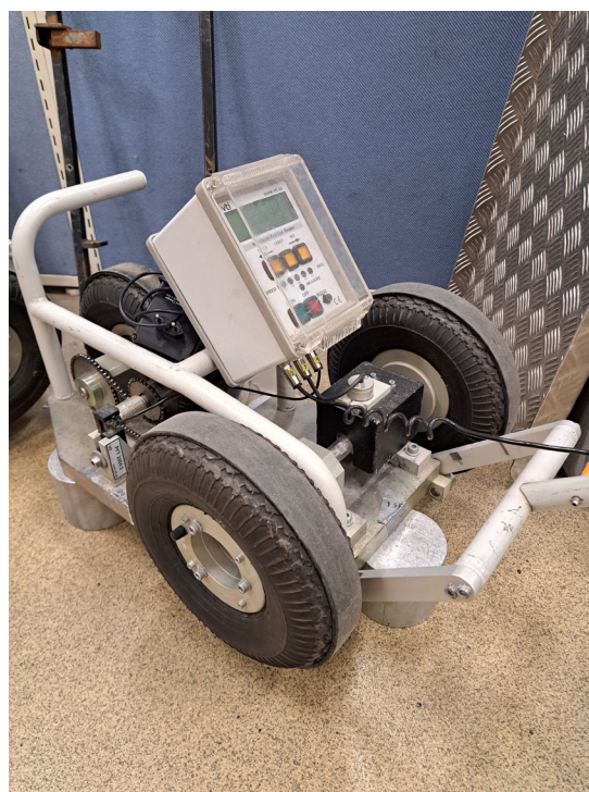
The measurement equipment, PFT2004.

The conditions during the measurements on site were that it was moist on the road and on the Actibump but not raining.